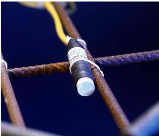
The ERE 20 attached to the reinforcement

The ERE 20 is a true, long life Reference Electrode, which can be cast into the cover concrete to check the cathodic protection and to monitor the corrosion state of reinforcing steel or predict corrosion. Normally in newly cast concrete structures, but the electrode can also be installed in existing structures.